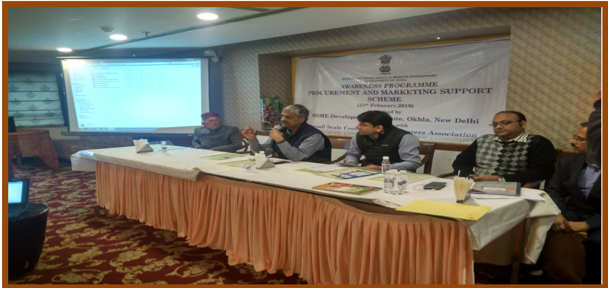
Director, MSME –DI, New Delhi addressing the participants during the Programme

MSME-Development Institute, New Delhi, Ministry of Micro, Small & Medium Enterprises organized an Awareness Programme under Procurement and Marketing Support Scheme on 21 st February, 2019 at Hotel Bellagio, 13-14, Community Centre, Ashok Vihar Phase-II, Delhi-52 in association with Cosmetic Manufacturers Association, New Delhi . A total of 50 nos. of entrepreneurs from Micro and Small Enterprises participated in the programme.