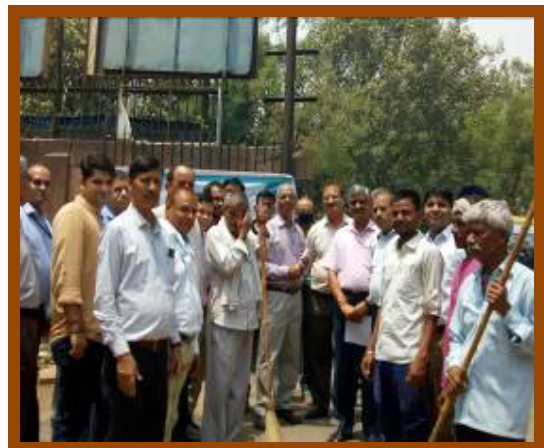
Flatted Factory Complex, Okhla