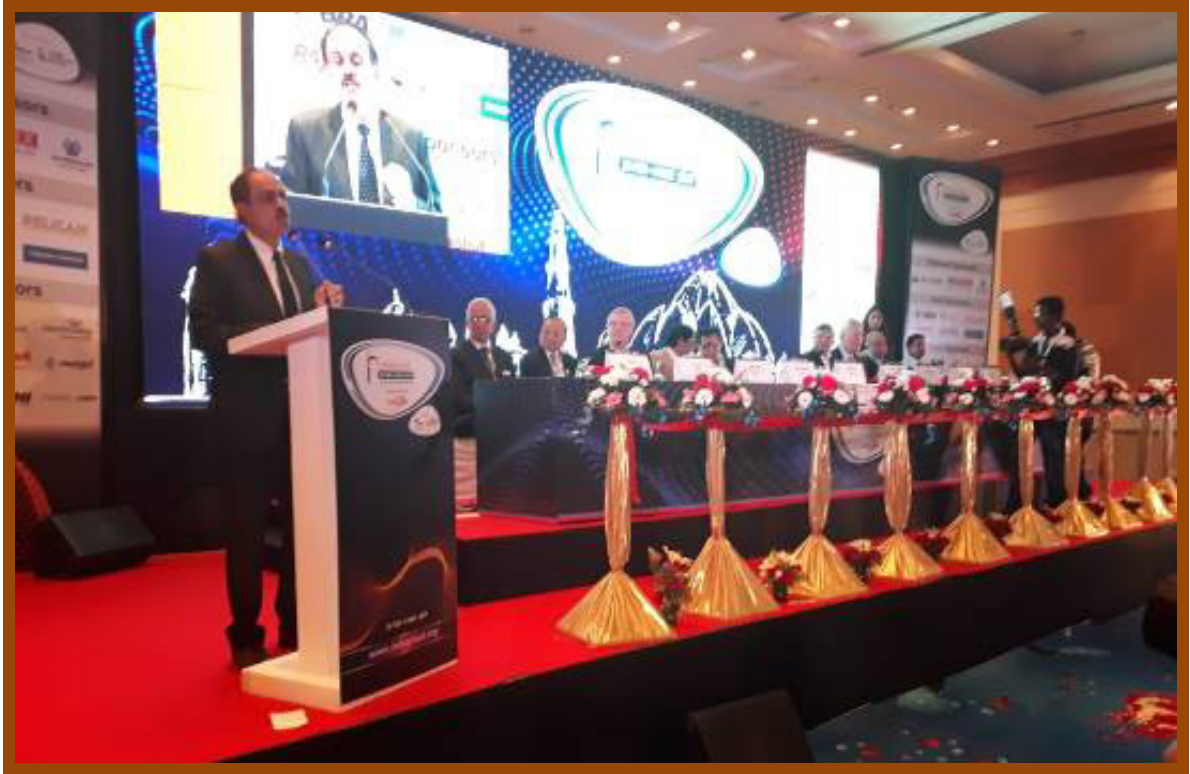
Shri Arun kr. Panda, Secretary (MSME) addressing the gathering during inaugural of India Plast Exhibition at Gr. Noida