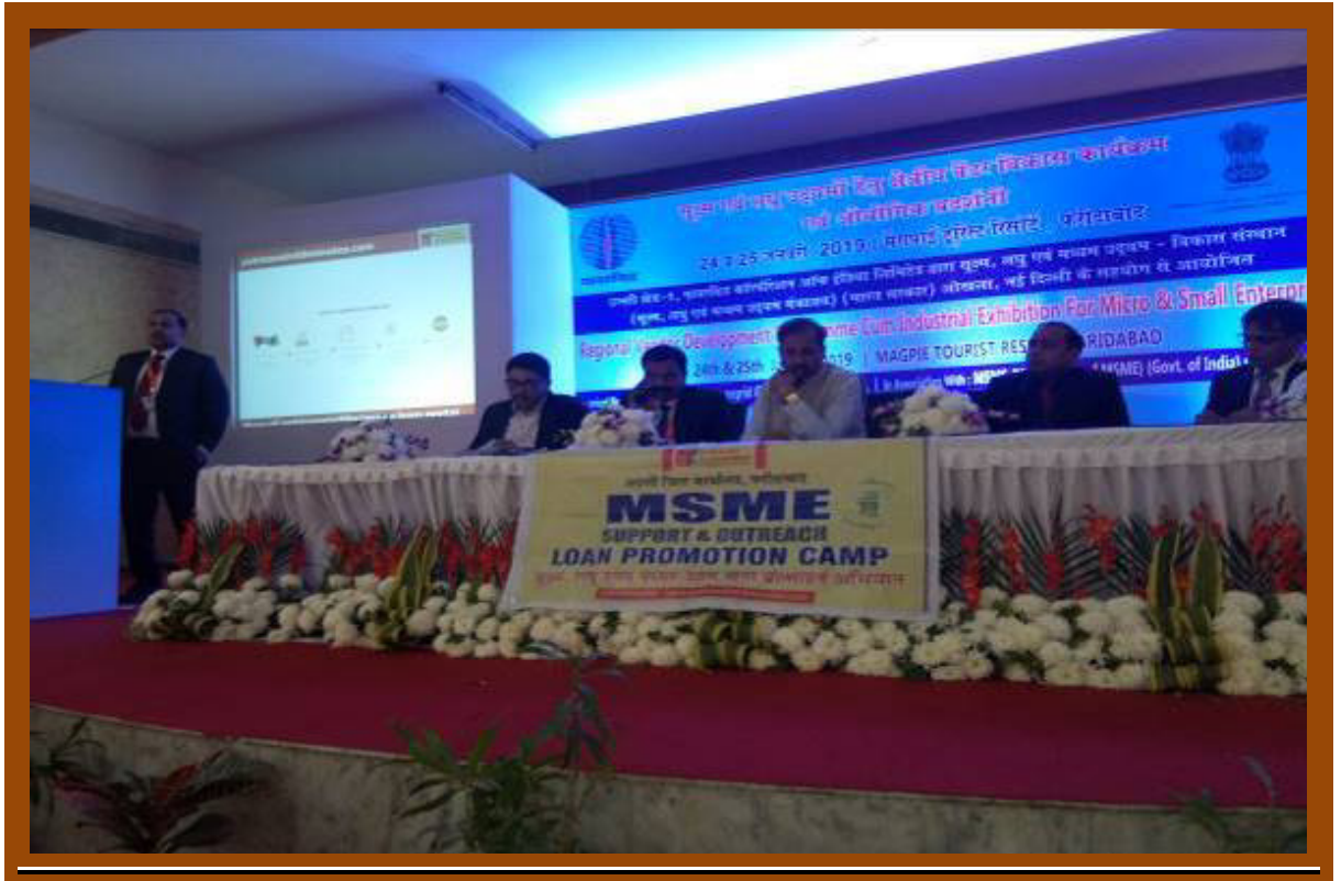
Presentation of Syndicate Bank During MSME Support & Outreach Programme organized by MSME-DI, N D in association with Powergrid and Vijya Bank at Hotel Magpie, Faridabad on 25.1.19