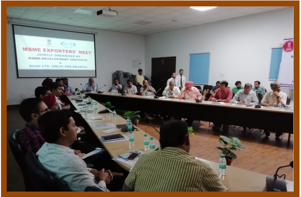
Participants attending the MSME Exporters Meet at MSME-DI, Extension Centre, New Delhi on 13 th September, 2018