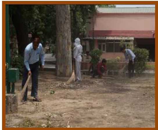
Cleaning of premises