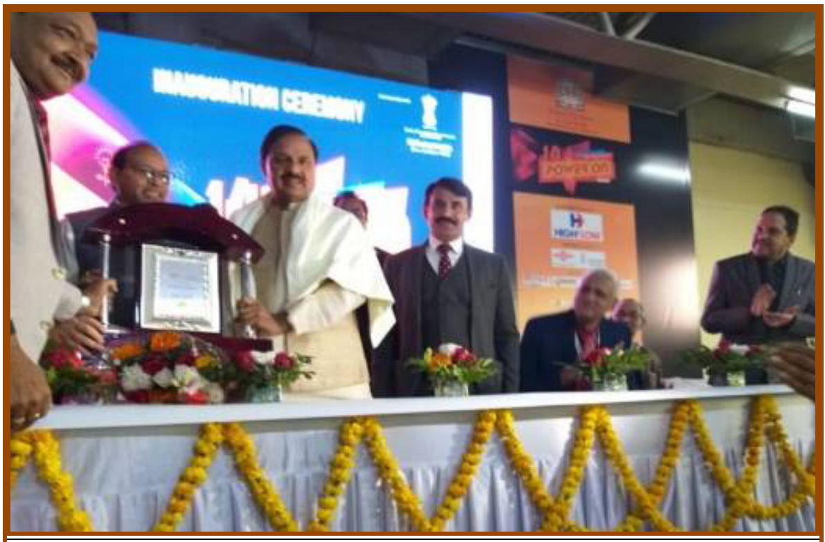
Dignitaries at Dias during the Inauguration of the exhibition