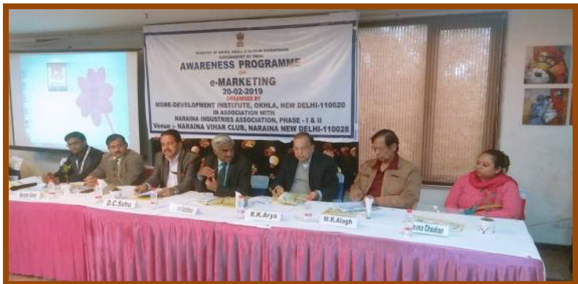
Dignitaries at Dias during Awzreness Programme on GeM & E-Marketing

MSME-Development Institute, Okhla, New Delhi, Ministry of MSME in association with Naraina Industries Association Ph 1 & 2 New Delhi organized an Awareness Programme on E-marketing & procurement on 20 th February, 2019 at Naraina Vihar Club, Naraina, New Delhi. A total of 60 nos. of entrepreneurs from Micro and Small enterprises participated in the programme.