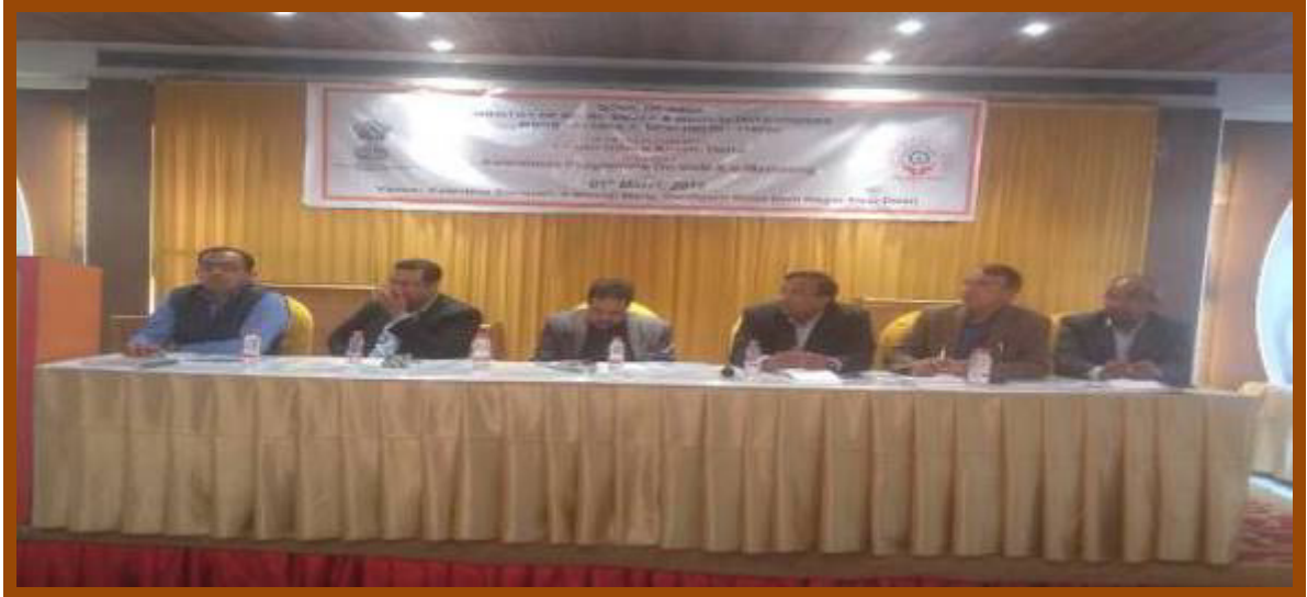
Dignitaries at Dias during Awareness Programme on GeM & E-Marketing

MSME-Development Institute, Okhla, New Delhi, organized an Awareness Programme on GeM & E-marketing for MSMEs on 01 st march 2019 at Valentine Banquet, Najafgarh road, Moti Nagar Indl. Area, New Delhi in association with Laghu Udyog Bharti, Delhi. A total of 70 nos. of participants attended the programme.