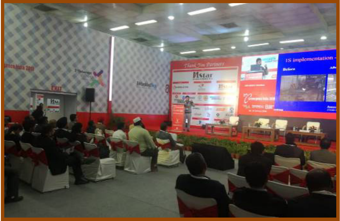
Technical presentation during Convergence India 2019