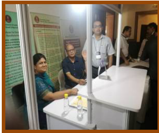
Stall of MSME-DI, New Delhi