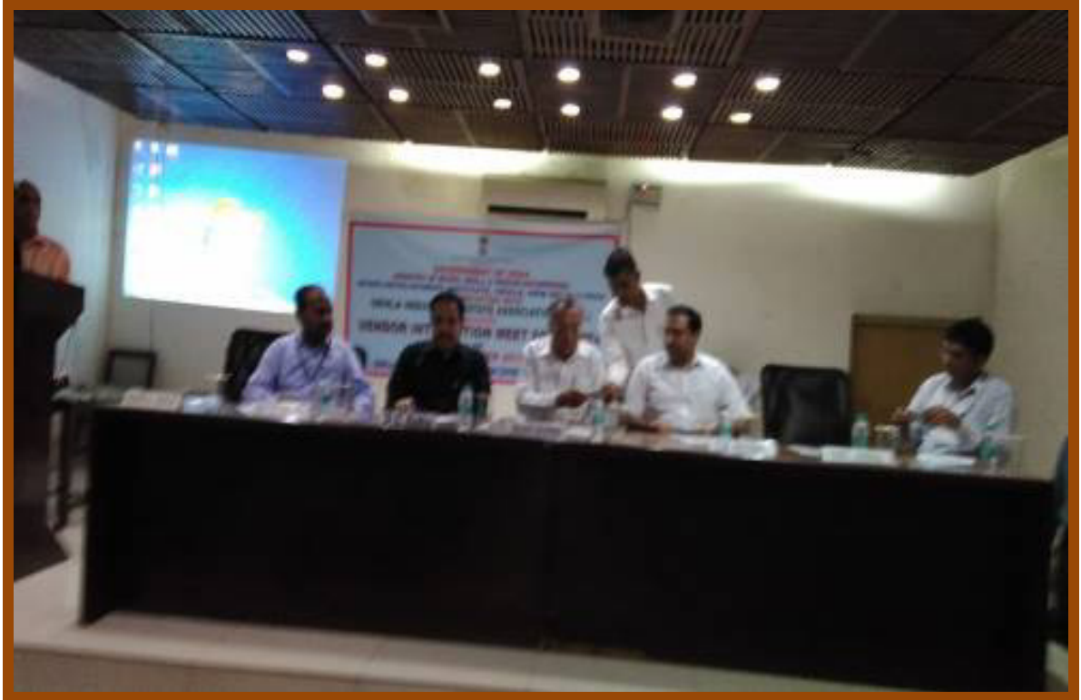
Dignitaries at Dias during Vendor Interaction Meet on 11.10.18