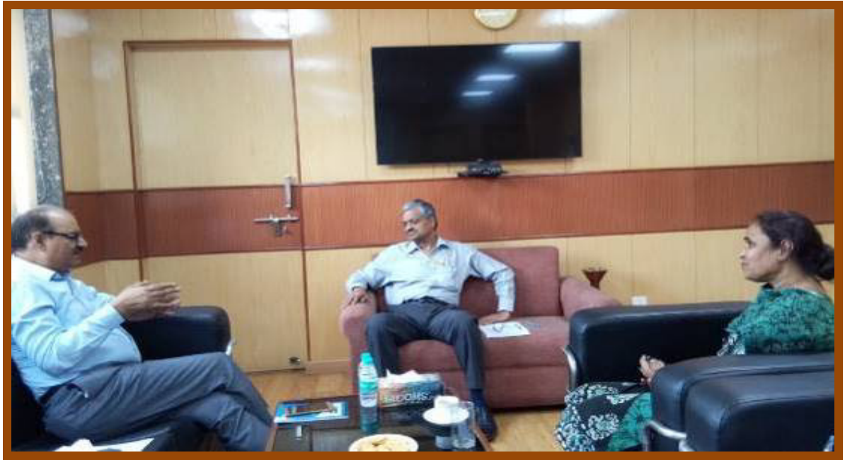
Discussion during MSME Convergence Meeting