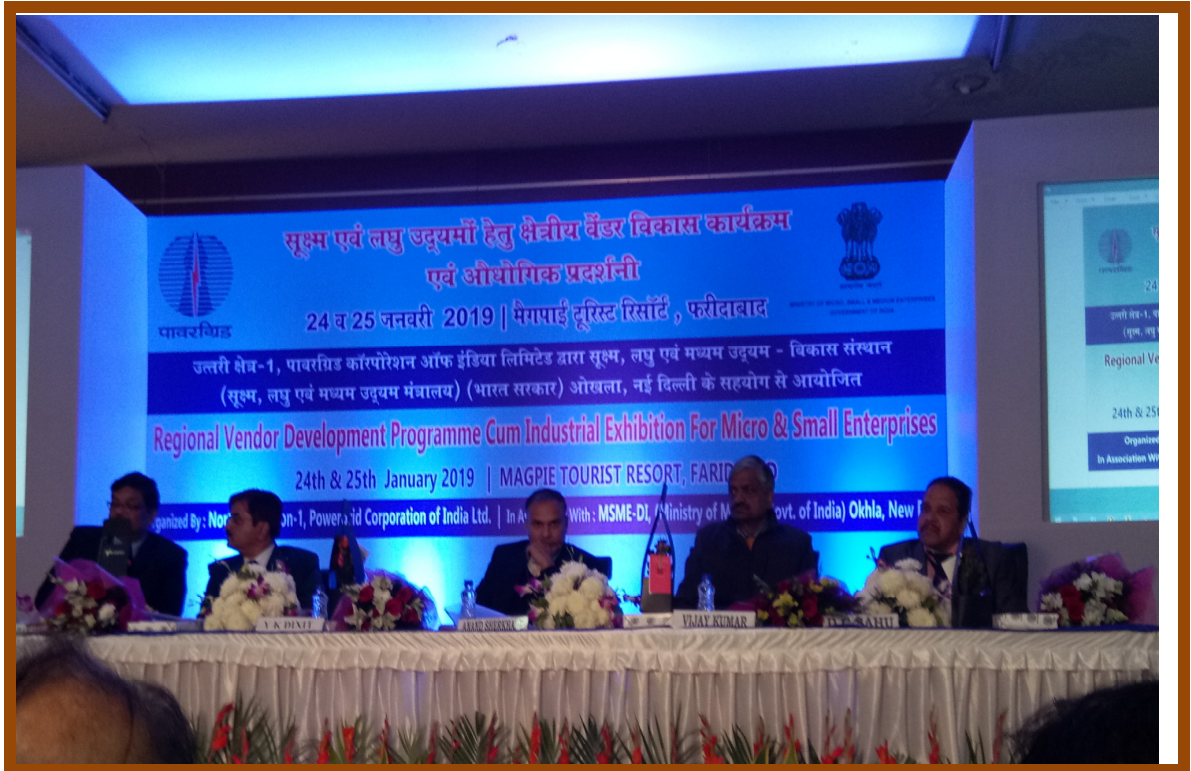
National Vendor development Programme with Powergrid Corporation at Magpie Tourist Complex, Faridabad on 24.1.2019