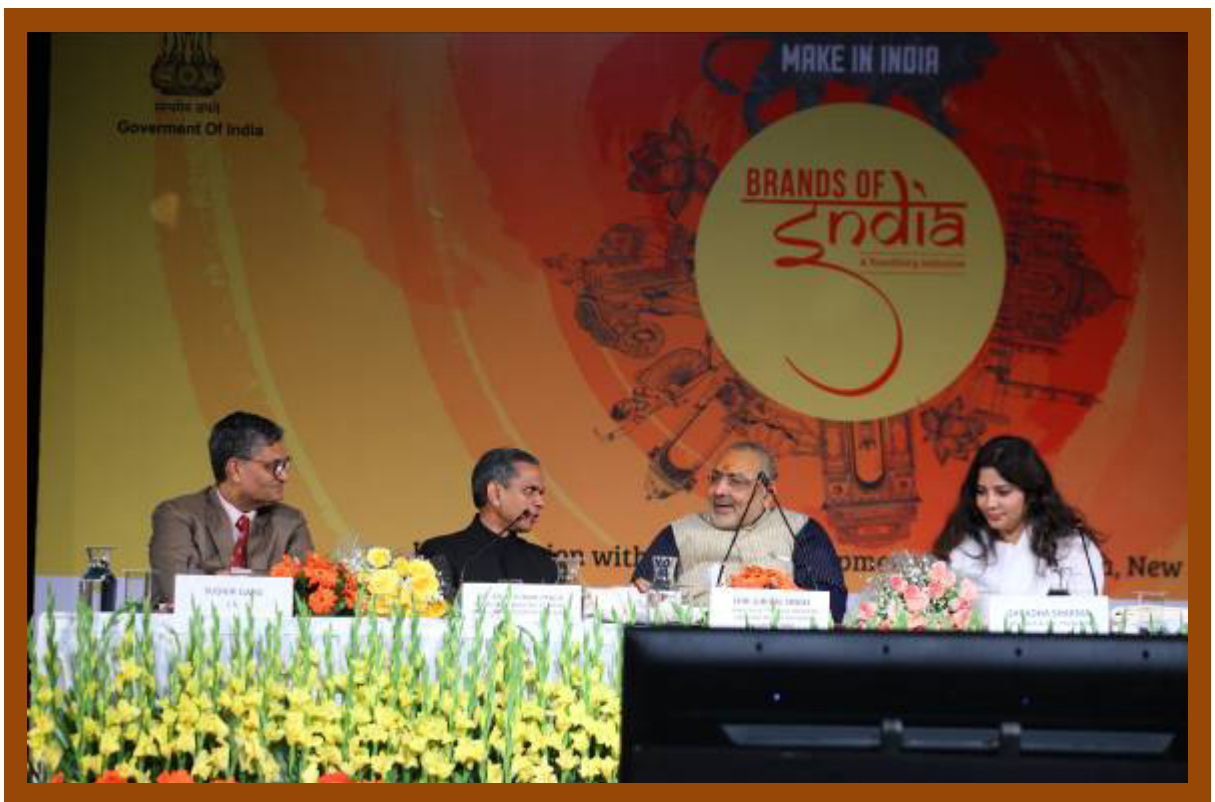
Shri Giriraj Singh, Hon'ble Minister of State (I/c), MSME with other dignitaries on Dias during the programme at India Habitat Centre, New Delhi on 27.2.19

The Institute in association with M/s Your Story Media Pvt. Ltd, Bengaluru organized a one day seminar/Conference and Awards function on 'Brands of India on February 27, 2019 at Stein Auditorium, India Habitat Centre, New Delhi. The aim of the programme was to felicitate successful MSE entrepreneurs of various states who have achieved landmark success in last three years and presenting successful MSMEs as an example to New Entrepreneurs with a view to help and promote young entrepreneurs. The programme highlighted the discussion on marketing, export including achievements made by many successful entrepreneurs and their contribution to the MSME Sector. More than 340 participants participated in the programme. The programme was graced by the august presence of the Hon'ble Minister of State (I/c) MSME, Shri Giriraj Singh, Shri Arun Kumar Panda, Secretary (MSME), AS & DC (MSME) and other dignitaries & prominent persons.