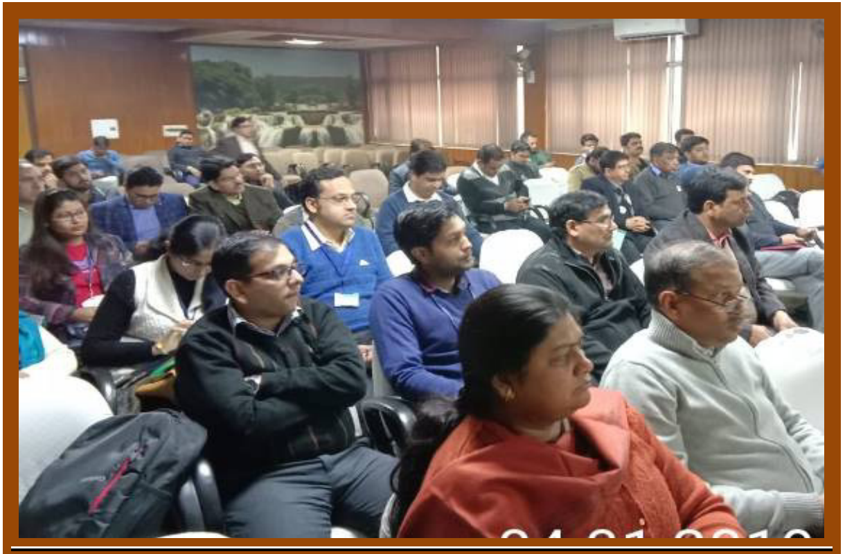
Participants attending the MSME Support & Outreach Camp in the Hall of Faridabad Industries Association, Faridabad on 4 th January, 2019