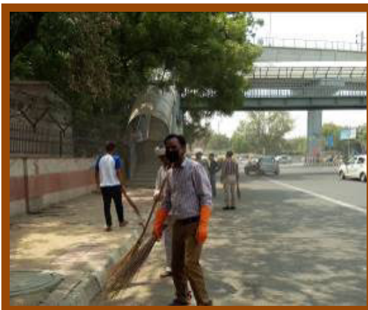
Road Side Cleaning Activity