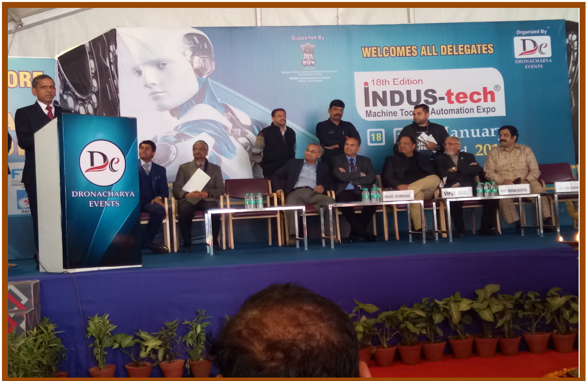
Indus-tech on Machine Tool & Automation Expo at sector 12, Faridabad on 18.1.19