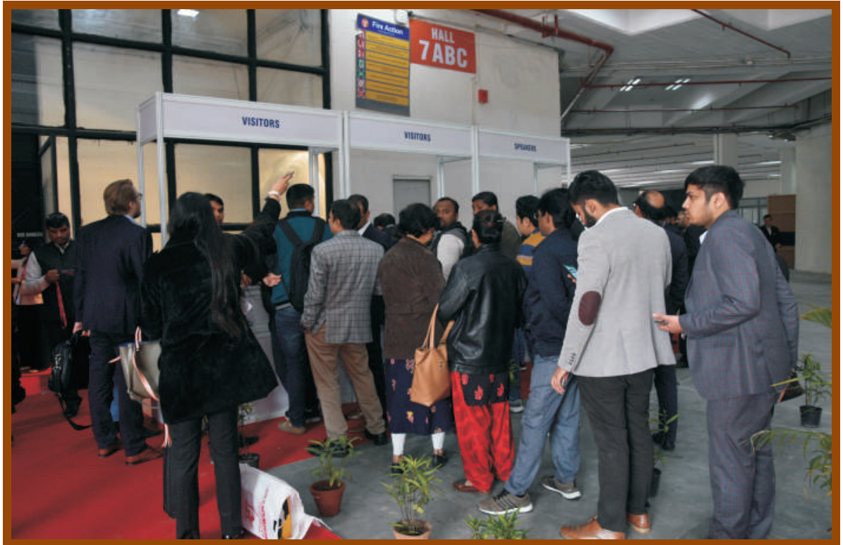
Visitors visiting the Exporail India 2019 at Pragati Maidan, New Delhi