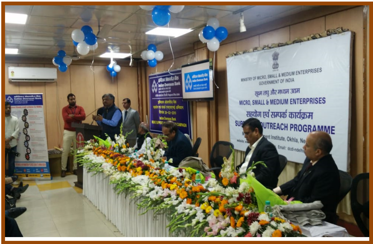
MSME Support & Outreach Camp at MSME-DI, Okhla, New Delhi on 28.2.19