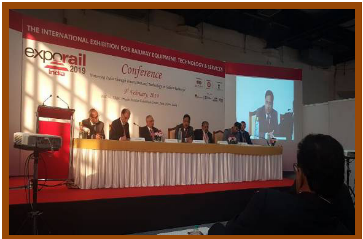
Dignitaries sitting on the Dias during the event at Pragati Maidan, New Delhi