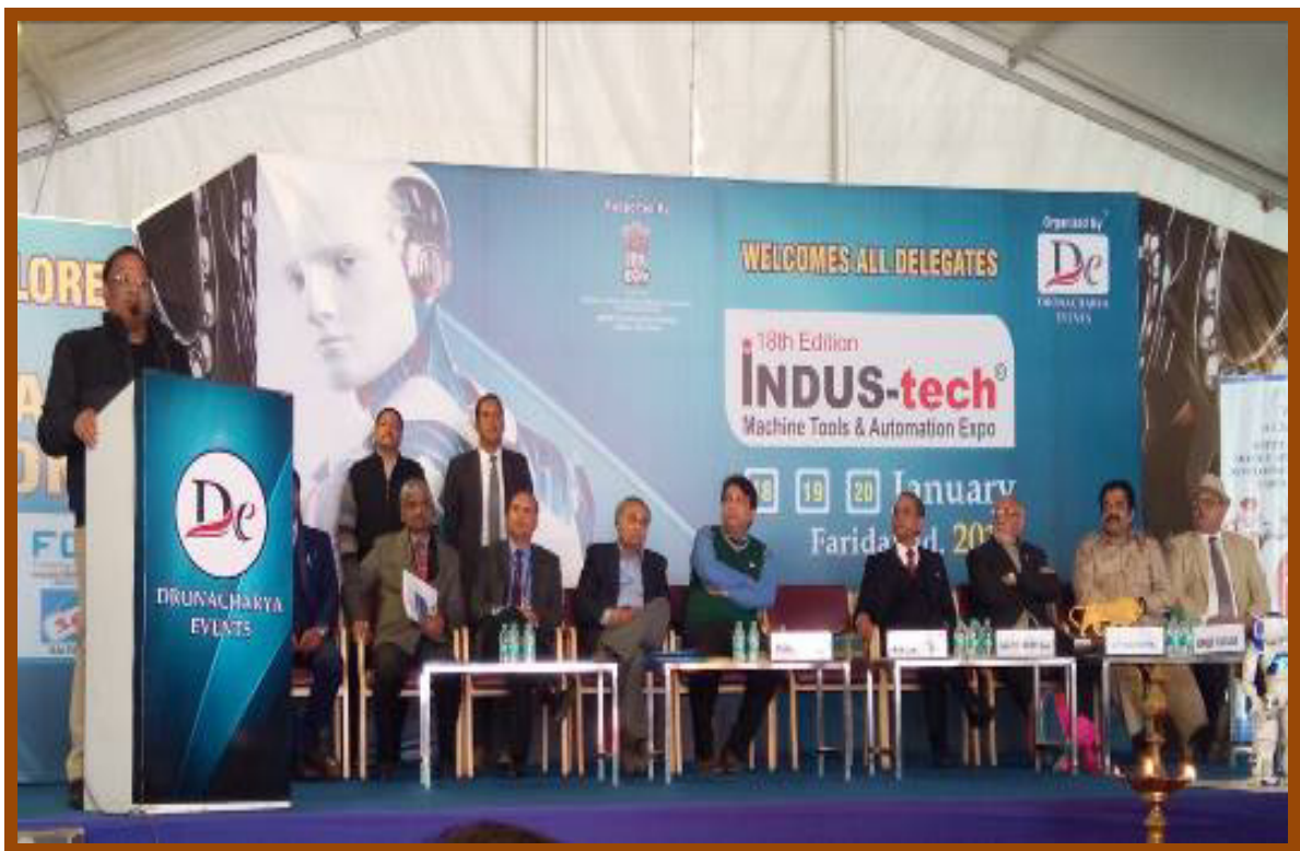
Hon'ble Minister, Industries and Commerce Department, Haryana, Sh. Vipul Goel addressing the participant during INDUS-TECH, Faridabad on 18.1.19

off the shelf production aids, accessories, consumables, software & consultancy. The event was inaugurated by the Hon'ble Cabinet Minister, Haryana Industries and Commerce Department, Sh. Vipul Goel in presence of Shri Ram Mohan Mishra, AS&DC, Sh. Anand Sherkhane, ADC & other dignitaries. Total 54 MSE Units were supported by MSME DI Okhla New Delhi during exhibition under PMS scheme. MSME DI, New Delhi also put a stall in the exhibition and 350 nos. of visitors were well attended by the officers present in the stall. Technical sessions was organized and managed by the officers of this institute in which, the Director, MSME-DI gave the detail presentation about the PMS, ZED, Lean Manufacturing Scheme, Design Clinic Scheme etc. EEPC representative explained the various export incentives available. LEAD Bank & Bank officers from Syndicate Bank also gave the presentation about PSB loan in 59 minutes and financial schemes for MSME sector. Officer from NHPC gave the detail presentation on the requirement of NHPC and the Vendor registration procedures of NHPC.