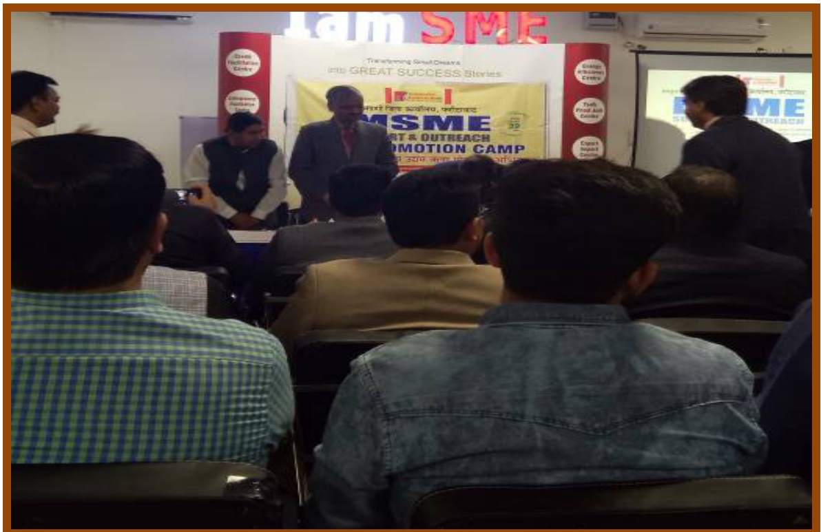
Director, MSME –DI, New Delhi answering the queries of the MSEs during the MSME Support & Outreach Camp at hall of IamSME, Faridabad on 30.11.18