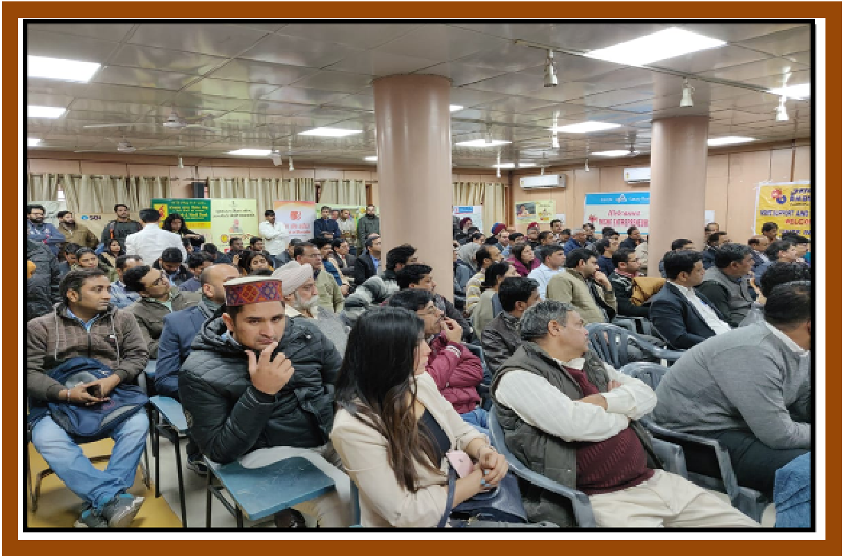
Participants attending the MSME Support & Outreach Camp at MSME-DI, Okhla on 10 th Jan., 2019