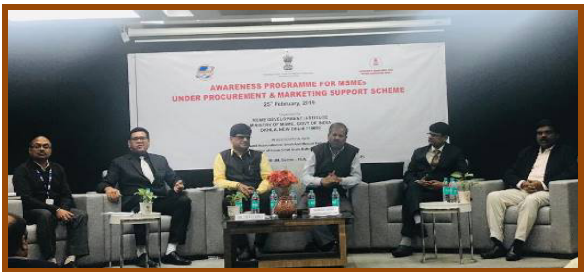
Dignitaries at Dias during Awareness Programme on GeM & E-Marketing

A one day Awareness Programme for MSMEs was organized at the auditorium of World Associations for Small & Medium Enterprises, WASME House, Sector 16, Film City, Noida (UP) on 25 th February, 2019 in association with WASME and Federation of Indian Small Battery Associations. The programme was attended by 51 participants who highly appreciated for the knowledge shared by the concerned officers through presentations and discussion.