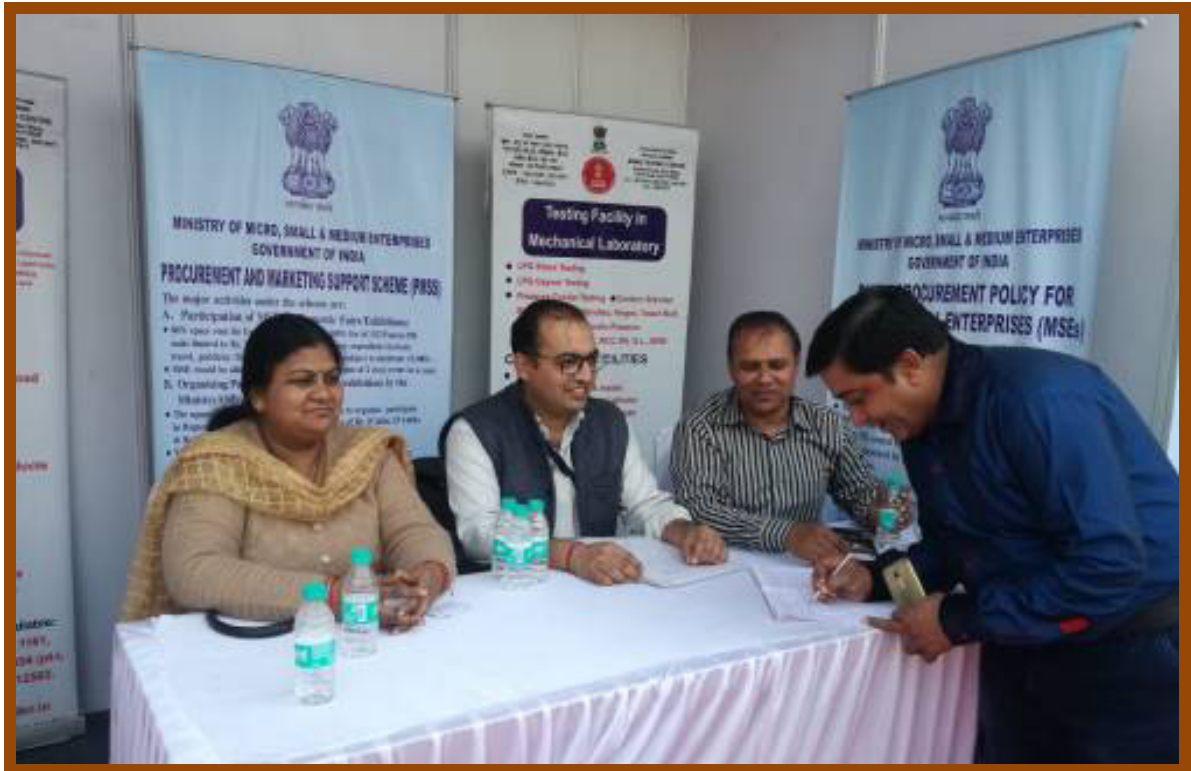
Attending the Visitors at Stall of MSME-DI, New Delhi during the event