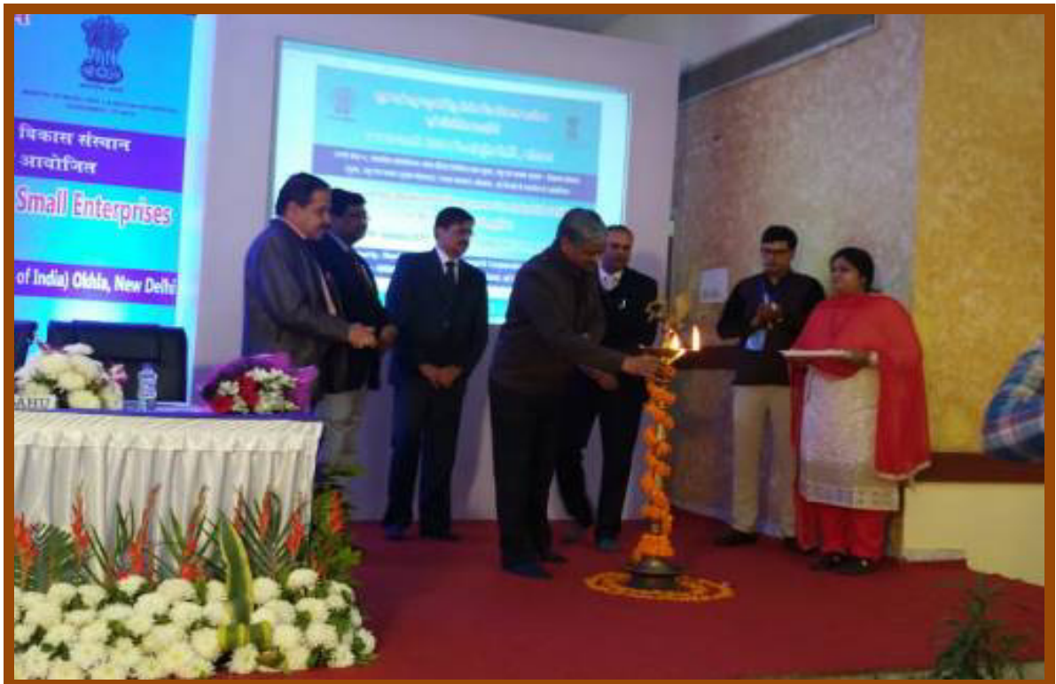
Lightening of the lamp by the dignitaries during the NVDP at Magpie, Faridabad on 24.1.19